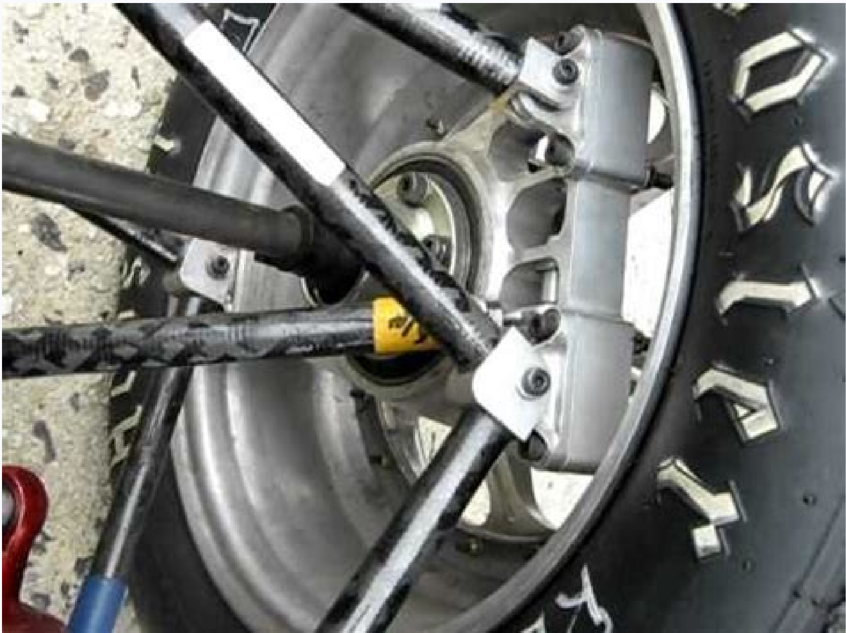
Steering gear vs rack and pinion. Rack and pinion used in real life. Different types of rack and pinion.